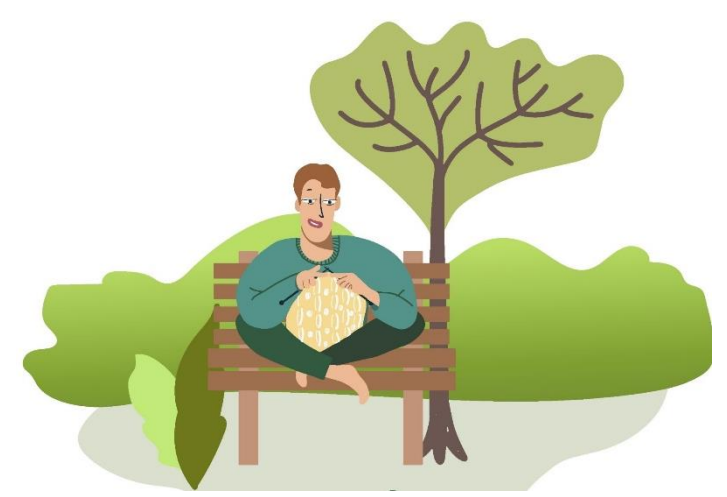
WORLD WIDE KNIT IN PUBLIC DAY 2025 SATURDAY 14 June